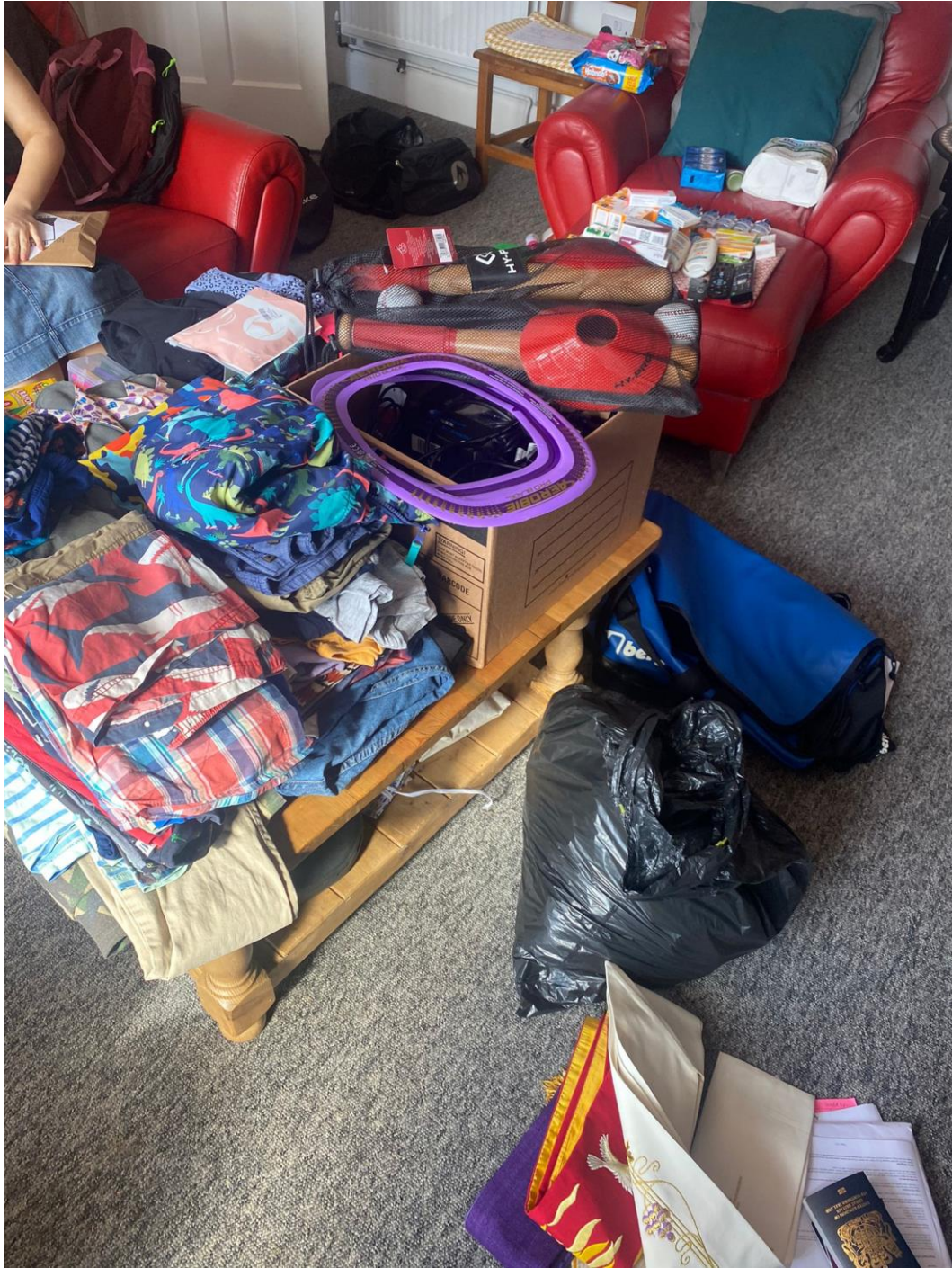
'Come away to a deserted place all by yourselves and rest a while'.