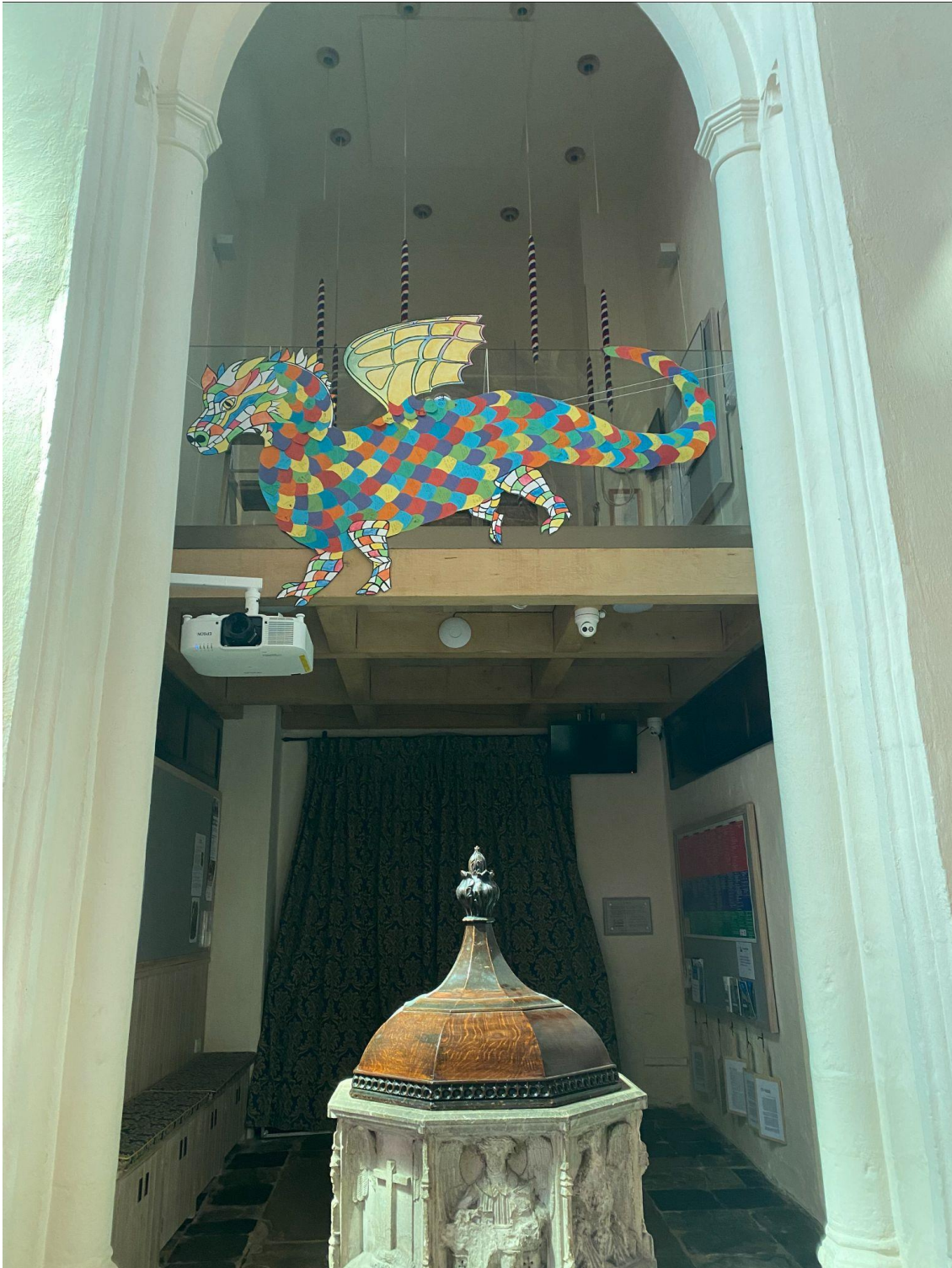
On Sunday we celebrated our patronal festival which is the St Margaret of