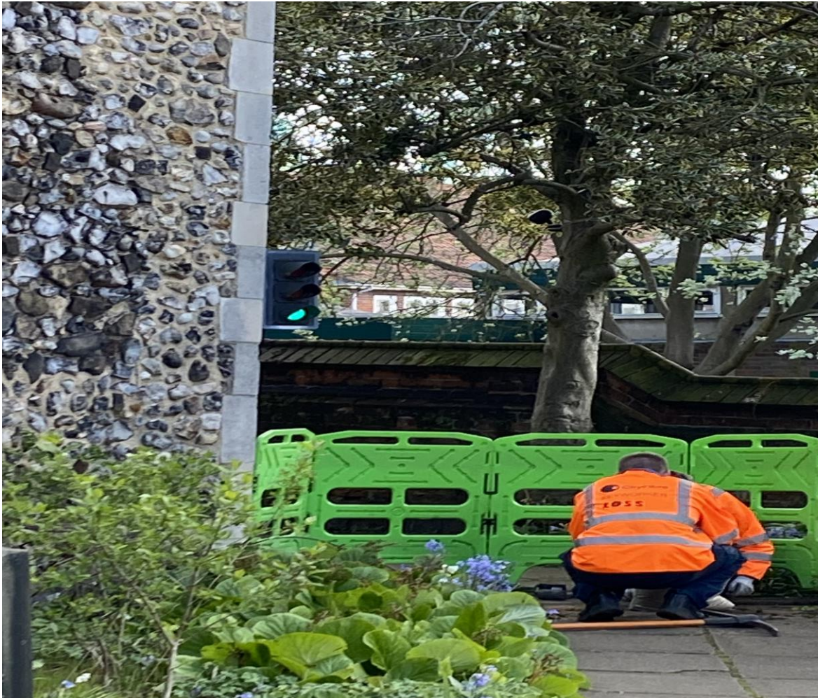
City Fibre installing broadband into the church this week.