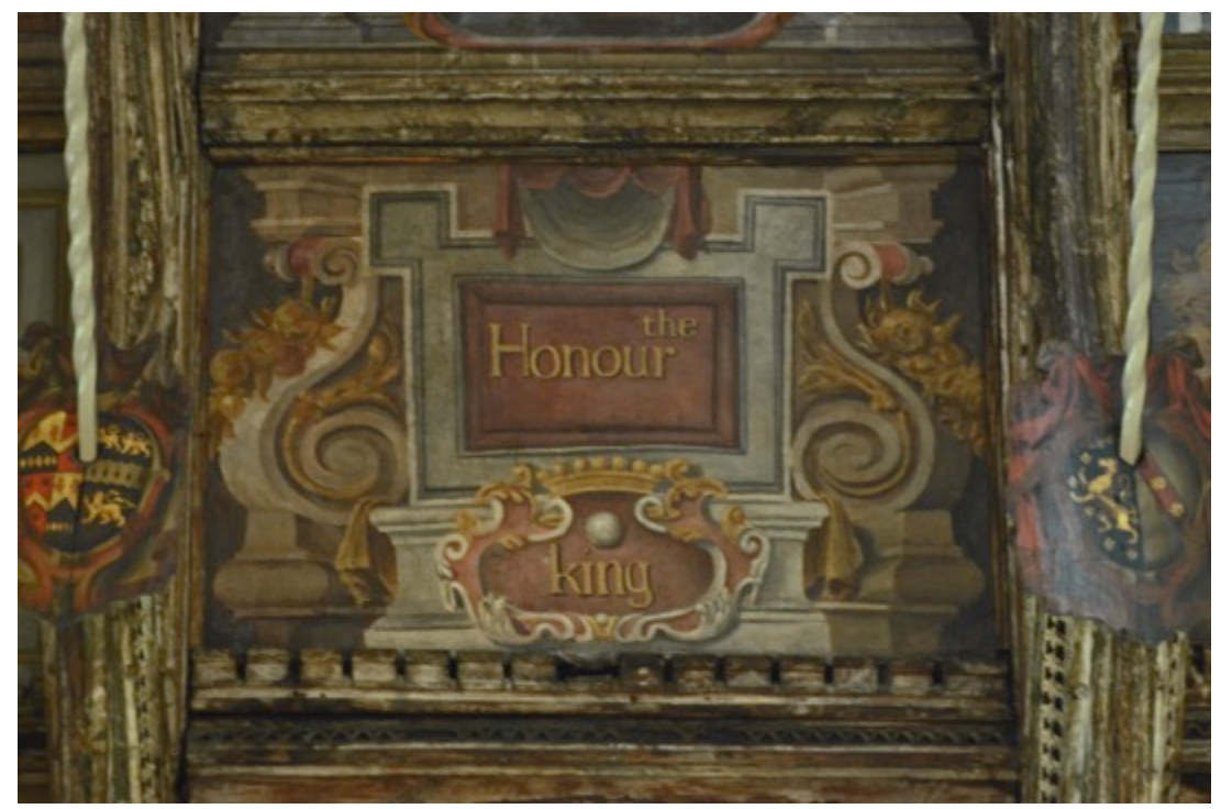
The painting is probably local work and consists of 50 panels, all but two of which are symmetrical. The ten centre "sky" panels are decorated with clouds and stars. The text 'Honour all Men. Love the Brotherhood. Feare God. Honour ye King.' on four panels is from 1 Peter 2.17.

The remarkable baroque paintings on the plaster and panels of the roof were devised as an elaborate tribute to King William and Queen Mary.