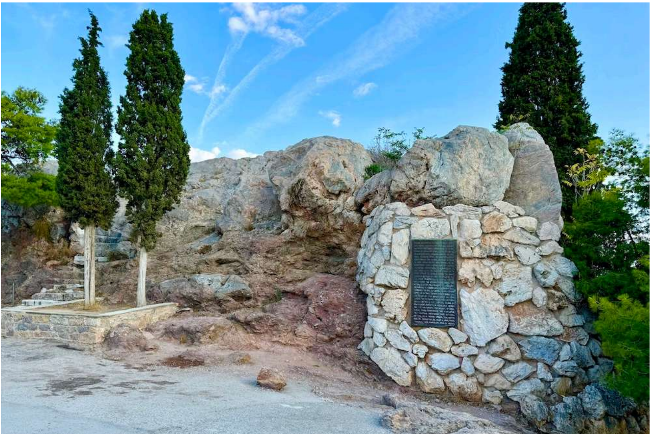
The steps to the Mars Hill, 'The Areopagus', The Hill of the god Ares